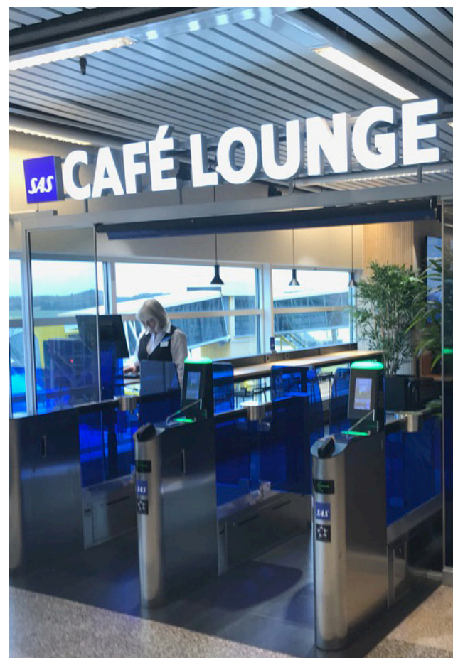
Lounge Access gates at Malmö Airport, Sweden

Combined with a biometric identification system such as a facial recognition camera, the Lounge Access AFL provides an even more convenient and simple access-check of passengers. The facial data can be captured while the passenger is approaching the gate and compared with the data stored in the airline or operator database. When enrolled it can also be compared with the data stored on the membership card.