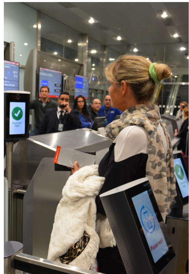
Biometric boarding gates at Miami Airport, USA

Through the integration of an optional biometric identification system it is possible to use Gunnebo's gate not only for domestic but also for international flights. A comparison of the facial image against the enrolled biometric data provides a secure, fast and convenient ID-check inside the gate.