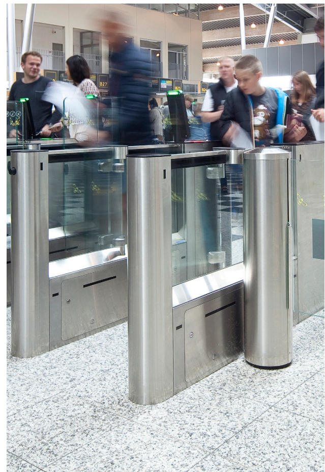
PreSec gates at Billund Airport, Denmark

With optional extension modules, it is even possible to use the PreSec gates for implementing a highly accurate queue management system.