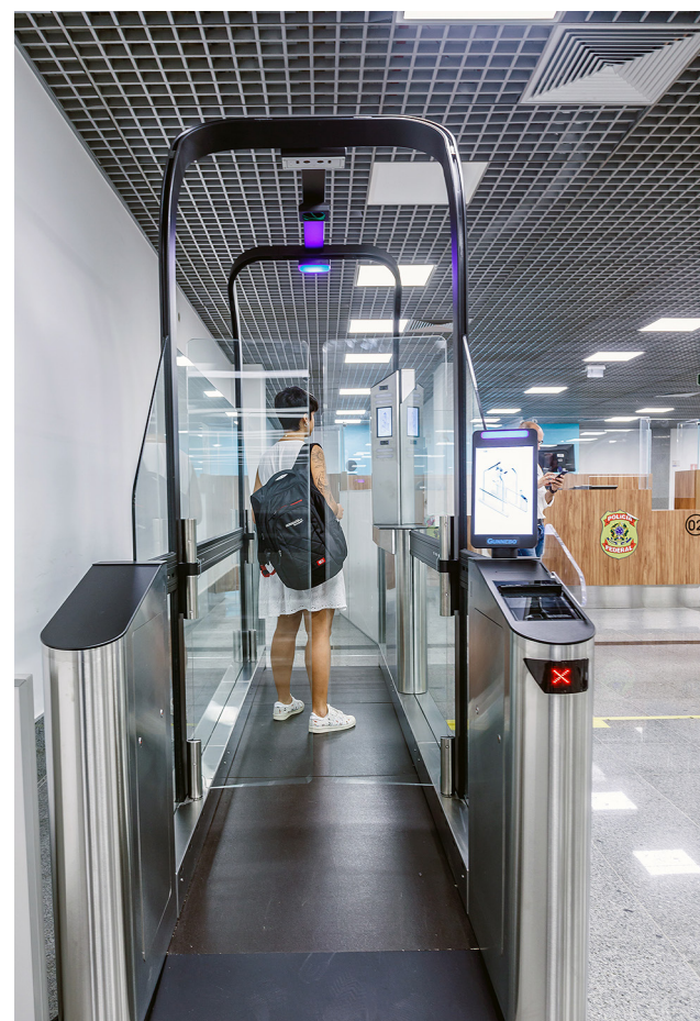
ImmSec gates at Salvador Airport, Brazil

The ImmSec's slim and ergonomic modules allow the gate to be installed in single or multiple lane configurations, with a minimal footprint when installed. There is also an ability to use a bidirectional function for staff as well as be used by PRM (Persons with Reduced Mobility), including standard and wide passage.