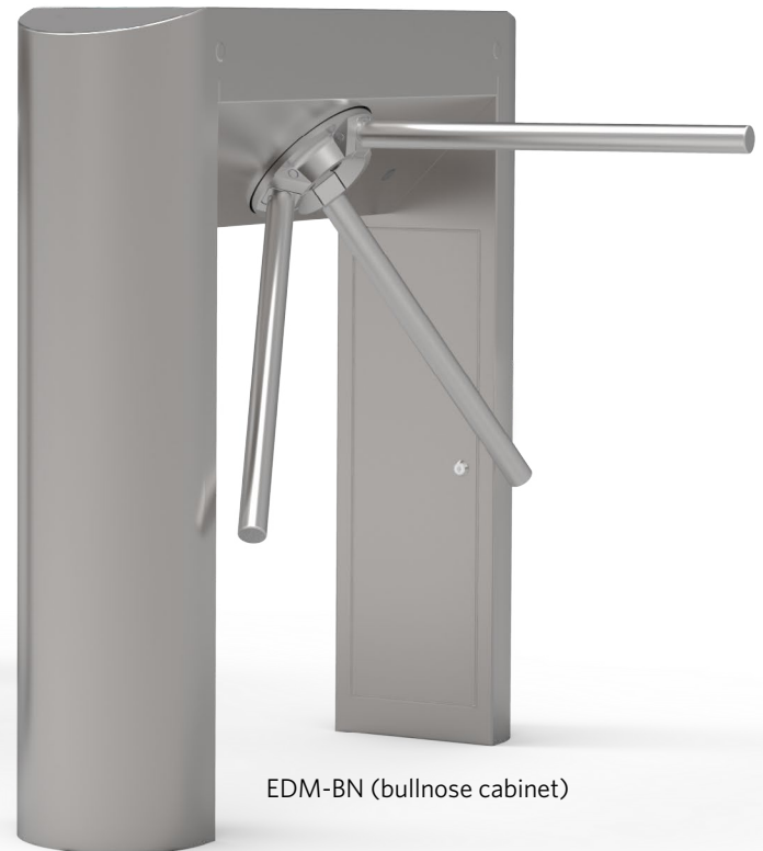
EDM-BN (bullnose cabinet)