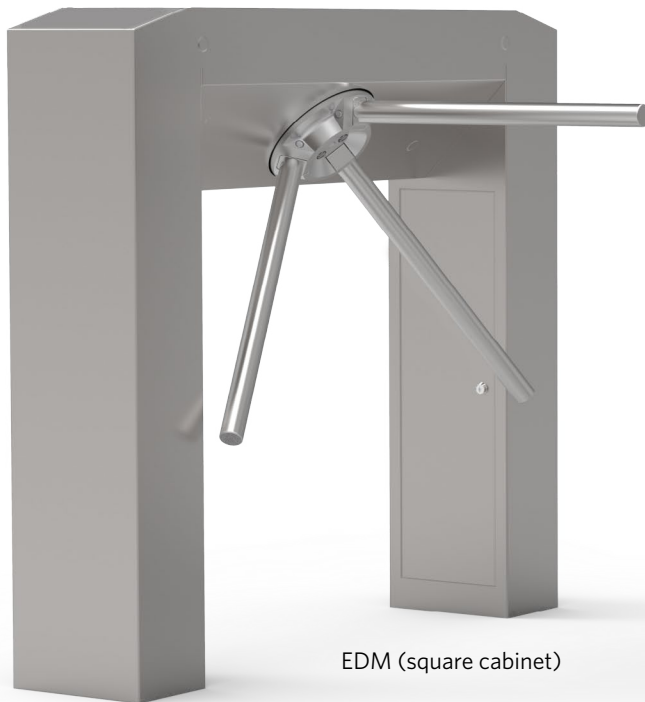
EDM (square cabinet)

The EDM is a waist high turnstile that provides single or bi-directional access control and/or patron counting. Motorized arm rotation provides a very comfortable passage experience for patrons. Upon loss of power or fire system input, the horizontal arm automatically drops to provide a clear exit passageway.