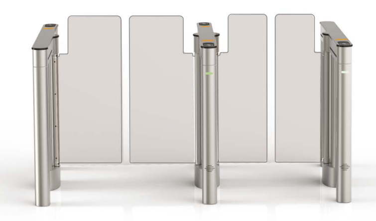
Multi-lane configuration with 36" passage width on left; 28" passage width on right - mid-height barriers

Center cabinets that have a 28" passage barrier on one side and 36" wide barrier, or different height barrier, on the other side are available.