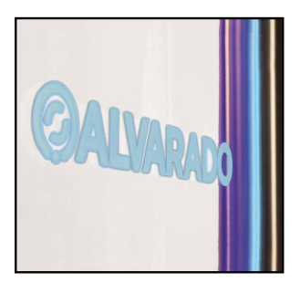
Side Panel Illumination (Static)

See the description under Turnstile Interface to Access Control System.