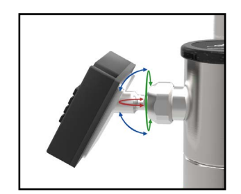
Adjustable Reader Mounting Attachment

Due to the extremely slim architectural profile of the SU5000, not all readers can be housed inside the cabinet. To accommodate larger readers and similar user interface devices, Alvarado offers an optional Adjustable Reader Mounting Attachment, which is factory installed on one or both ends of the turnstile. When ordering this option, provide the reader manufacturer, model number and a physical sample of the device to Alvarado.