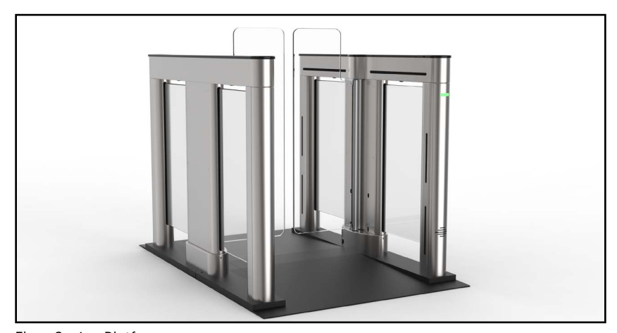
Floor Saving Platform