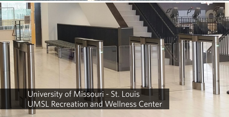
University of Missouri - St. Louis UMSL Recreation and Wellness Center