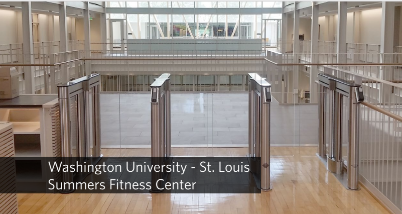
Washington University - St. Louis Summers Fitness Center