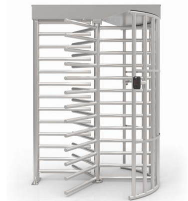
MST Full Height Turnstile