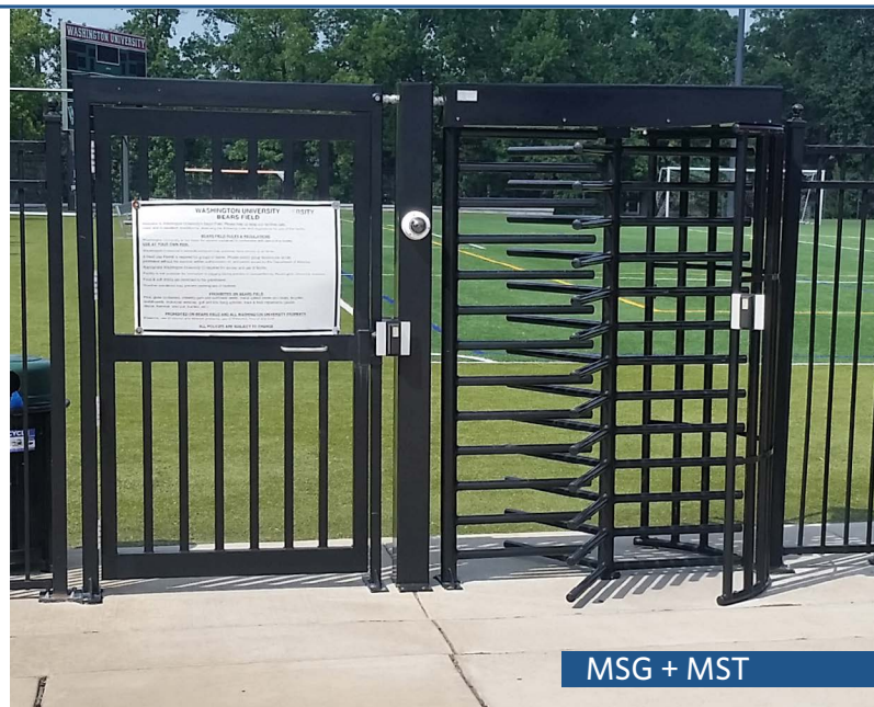
MSG + MST