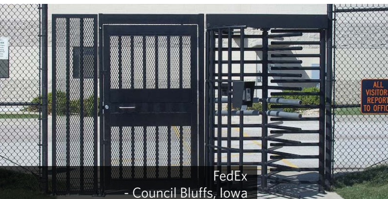
FedEx - Council Bluffs, Iowa