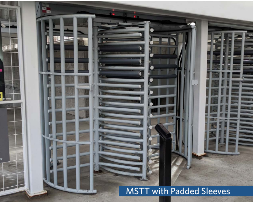
MSTT with Padded Sleeves