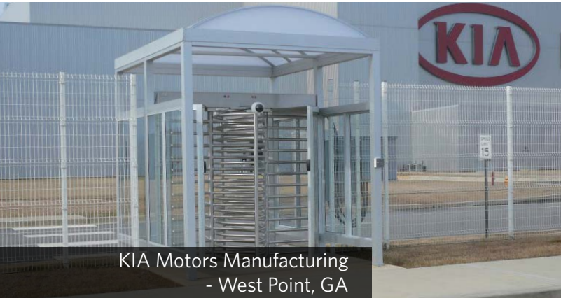
KIA Motors Manufacturing - West Point, GA