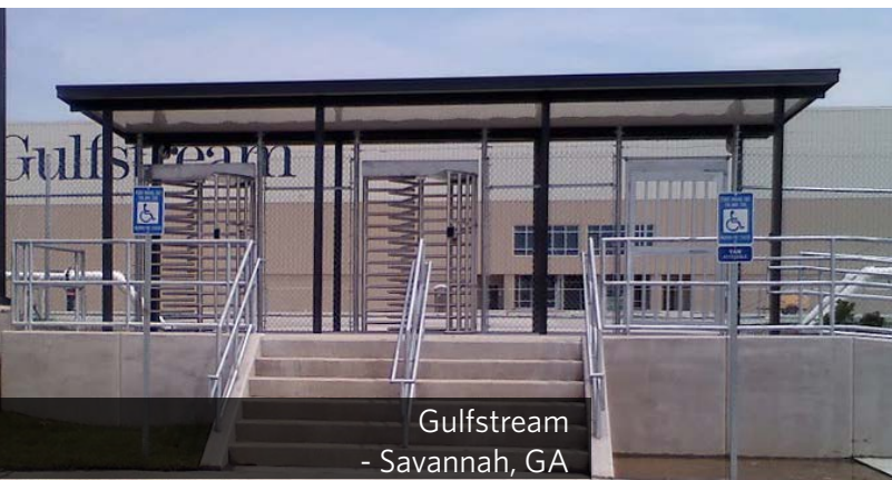
Gulfstream - Savannah, GA