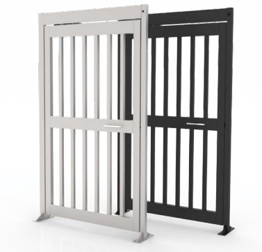
MSG Pedestrian Gate