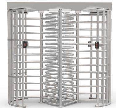
MSTT Tandem Full Height Turnstile